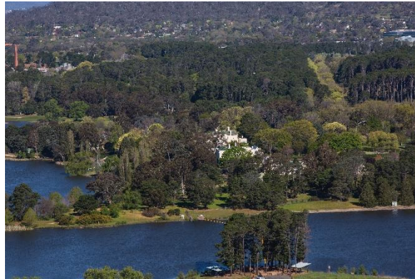
Government House, Canberra from the National Arboretum.